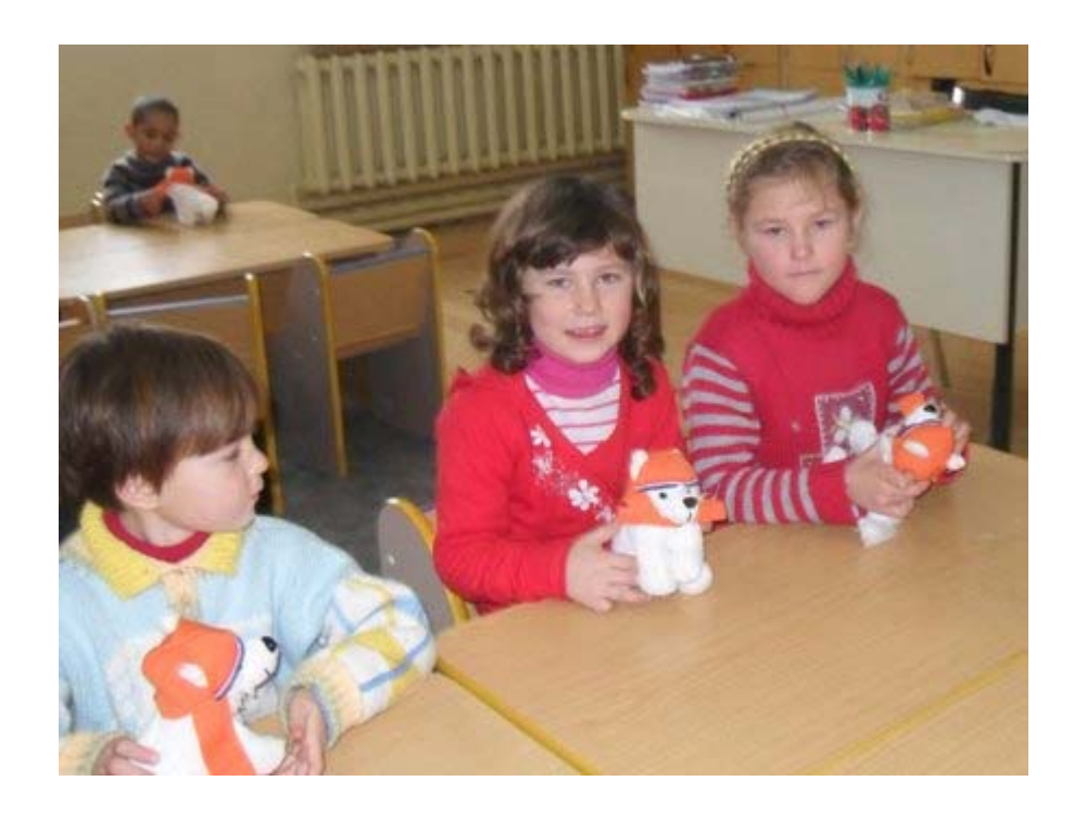
Some of the many young children who RCHF donated new fluffy teddy toys to thanks to our sponsors in The Netherlands and Romania.