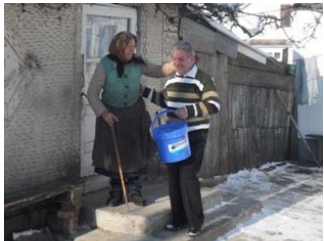
Delivering buckets filled with Christmas food to families and pensioners.