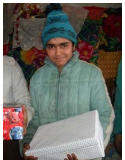
Our support was vital to these families at Christmas