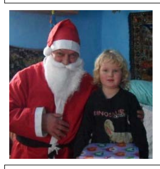
Father Christmas delivering Christmas joy to the Dorohoi Children

A few more of the Dorohoi children who were happy to receive Christmas presents via RCHF