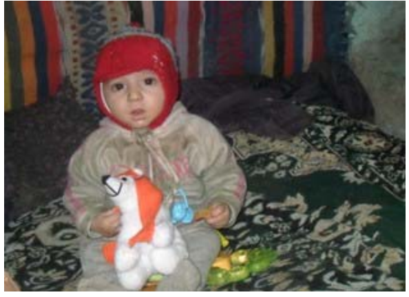
At RCHF we support all we can who need Christian support without discriminating on any grounds